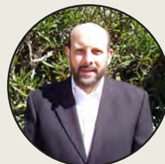
Mark Hyman, MD, FIAIME